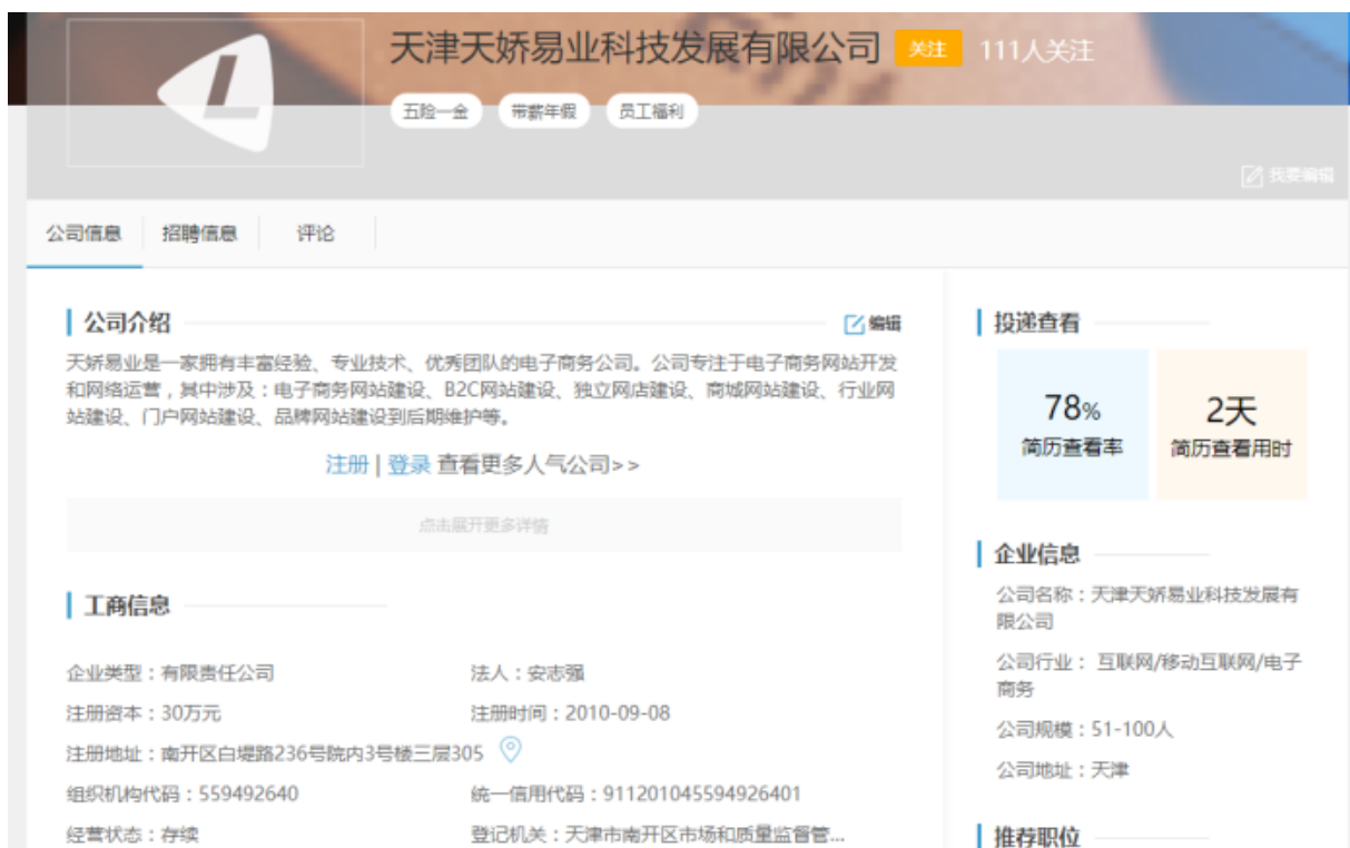
Liepin entry for 天津天娇易业科技发展有限公司 showing 安志强's name