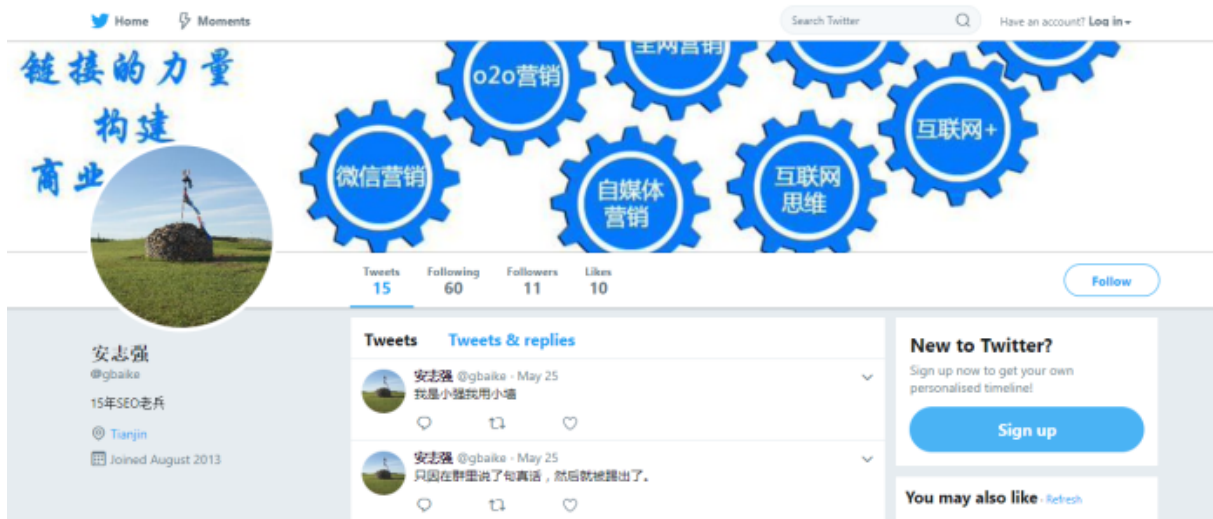
@gbaike's Twitter account

Armed with a name (安志强), a handle (gbaike), a location (Tianjin) and a company (天津天娇易业科技发展有限公司) a number of new sources of material on the individual can be discovered, including Twitter account @gbaike. The account is in the name 安志强, bears the handle @gbaike and has its location set as Tianjin. The account also refers to marketing in its profile image – this matches the description of the company from Zhaopin.