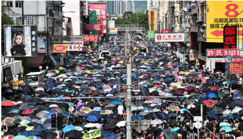
Protesters demonstrate in the district of Yuen Long in Hong Kong on July 27, 2019.

Senior Research Analyst for China, Hong Kong, and Taiwan, Freedom House